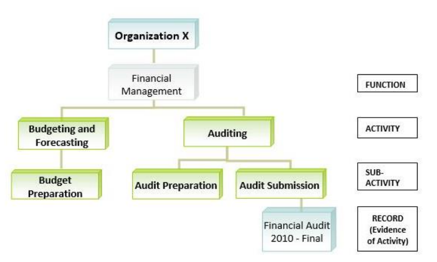
Fig. 1 – hierarchal map of file structure

An important feature of the file structure is that it is hierarchical . It associates the records (located at the lowest level) with the particular business process of a broader activity or set of activities carried out as part of the organization's function. This means that users of the system can navigate the structure to file or access records because they understand both the business processes and the records they create and use. This can be accomplished by applying <u>Functional Analysis</u> to the records in question.